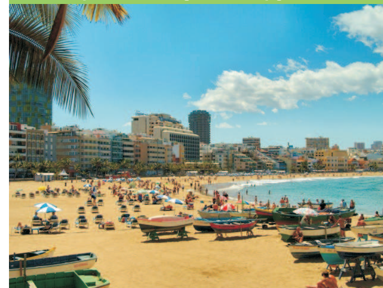
Gran Canaria pictures are courtesy of Cabildo de Gran Canaria web site http://www.grancanaria.com